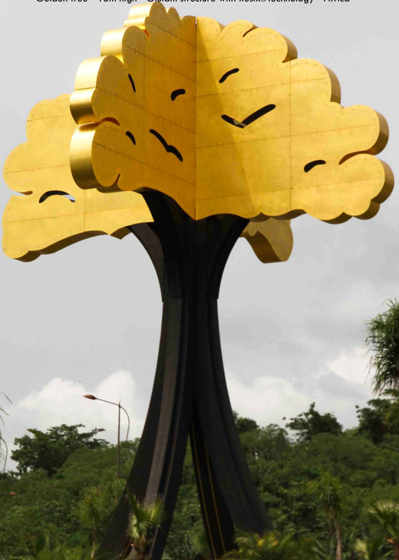
Golden tree - 15m high - Glulam structure with Résix® technology - Africa