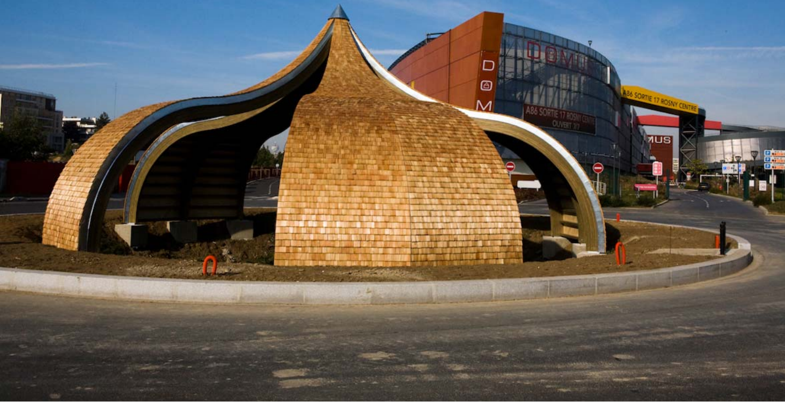
Glulam structure with shingles in larch - Rosny Sous Bois (France)