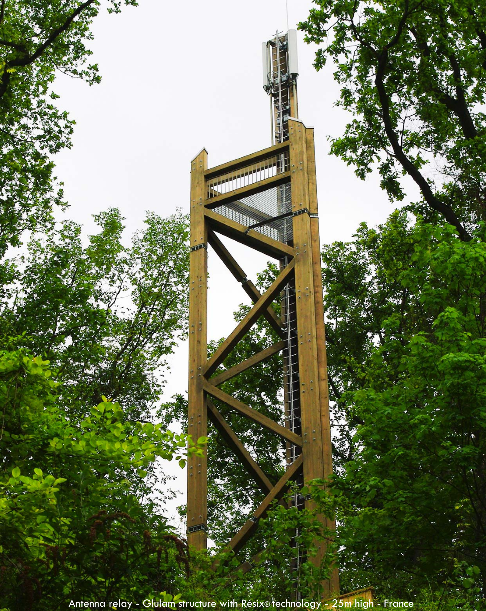
Antenna relay - Glulam structure with Résix® technology - 25m high - France