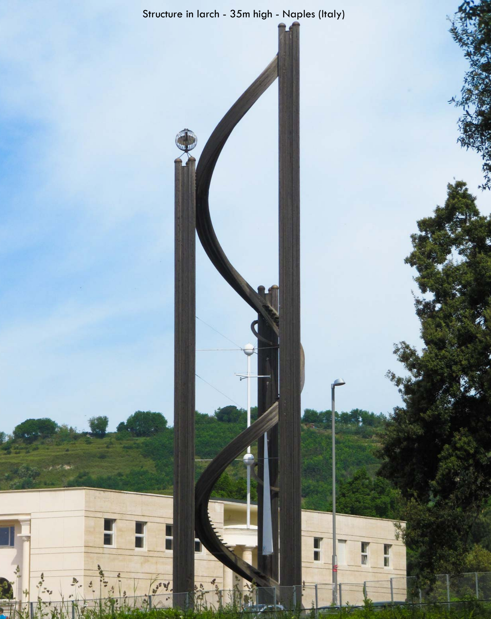
Structure in larch - 35m high - Naples (Italy)