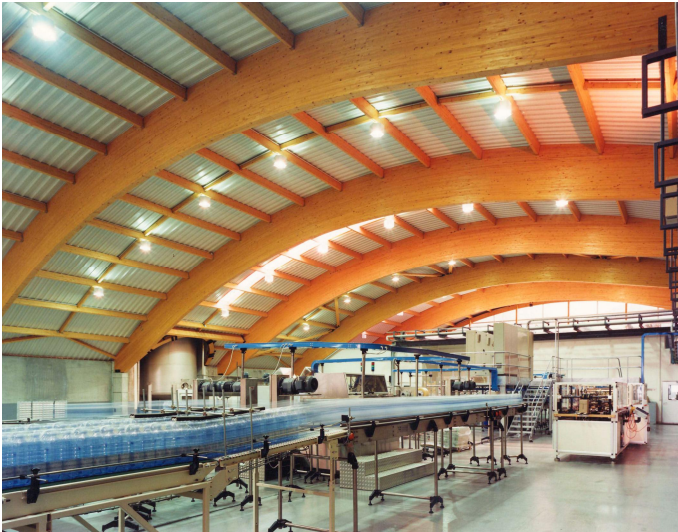
Example: Wattwiller Mineral Water Bottling Plant