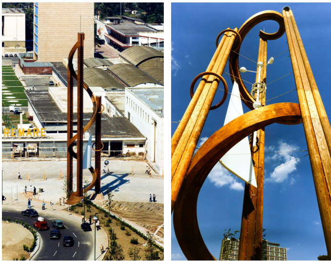
Example: Time Tower Larch framework - Height 35m - Naples (Italy)

Our conception and fabrication of complex projects demands a certain know how and technology. Our innovative Résix® assembly system bears witness.