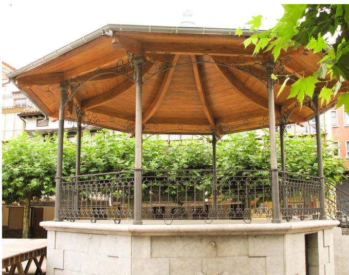
Example: structure in glued laminated oak Sapisol® insulated panels with oak under side Gazebo in Spain

We work regularly with such quality woods as spruce and pine and we select higher quality species such as oak, beech, ash, chestnut and red cedar for your higher end creations.