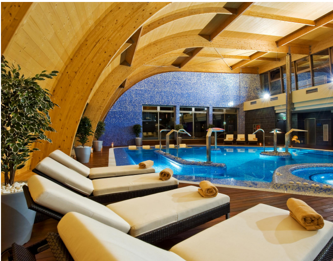
Example: Swimming Pool and Spa in Spain

Our technical know how is based on our mastery of glued laminated products. Our team pays particular attention to each and every detail in order to obtain a high quality end product.